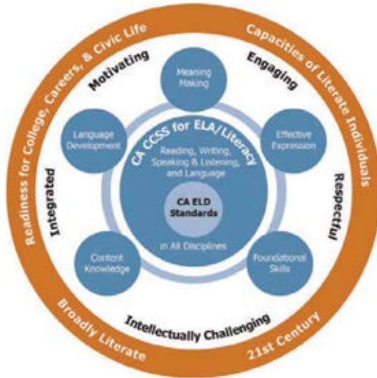
Figure 7.1. ELA/ELD Framework Circles of Implementation

An accessible long description of figure 7.1 is available at https://www.cde.ca.gov/sp/se/ac/ch7longdescriptions.asp#figure1 .