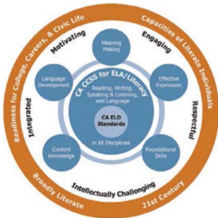
Figure 6.10. ELA/ELD Framework Circles of Implementation

An accessible long description of figure 6.10 is available at https://www.cde.ca.gov/sp/se/ac/ch6longdescriptions.asp#figure10 .