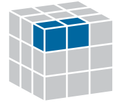
FIGURE 2. ICAs, IABs, and Focused IABs