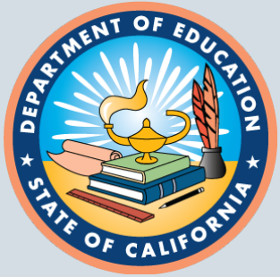
TONY THURMOND State Superintendent of Public Instruction