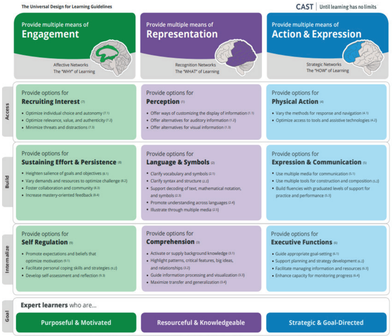
Figure 2.7: The Universal Design for Learning Guidelines

udiguidelines.cast.org | © CAST, Inc. 2018 | Suggested Citation: CAST (2018). Universal design for learning guidelines version 2.2 [graphic organizer]. Wakefield, MA: Author.