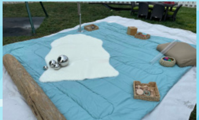
Infant Outdoor Space, Valley Oak Children's Service, Family Child Care Home Provider