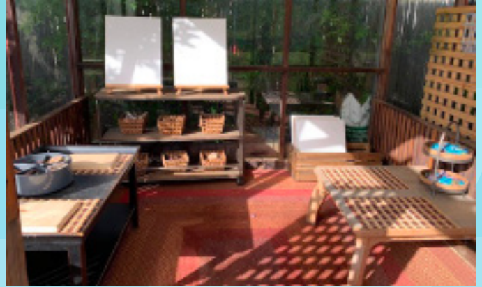
Nina Art Studio, Changing Tides Family Services, Family Child Care Home Provider

To date, the following partnering agencies have worked to enhance their outdoor learning environment: Chico State, Hansel & Gretel Day Care, Honcut Preschool, and Human Response Network. Programs added learning areas such as a Sound Garden, construction zone, trajectory wall, small world and mud kitchens. Notably, providers and teachers have indicated a reduction in the amount of challenging behaviors and weather permitting, most learning activities can take place outside.